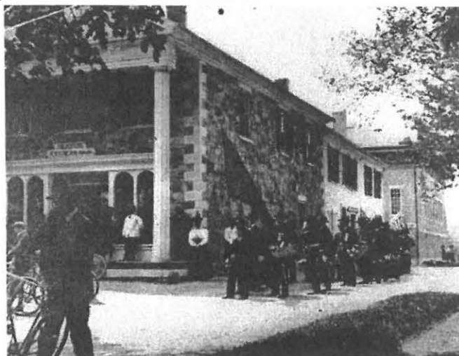
Decoration Day 1900 Civil War veterans marching by the Old Stone Store.

This is an exciting opportunity for the Society and for Sheffield. The building, constructed of stone from the Hewins quarry, was built circa 1835 by the Ensign family. It has had an important heritage in Sheffield and strategically forms the cornerstone of the north end of the green. When the frame section is removed and grass is planted in that area, the Town Hall, also built by the Ensigs, will be more visible.