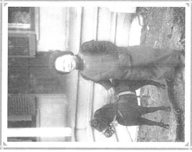
Look what Santa brought...a platform horse with wheels!