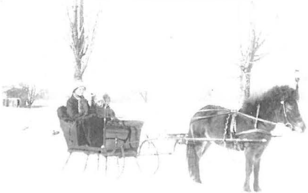
A one pony open sleigh