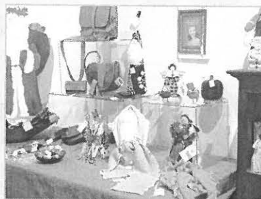
Some of the items for sale at the Old Stone Store