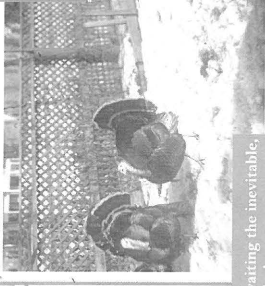
Turkeys awaiting the inevitable, Maple Ave., c. 1910