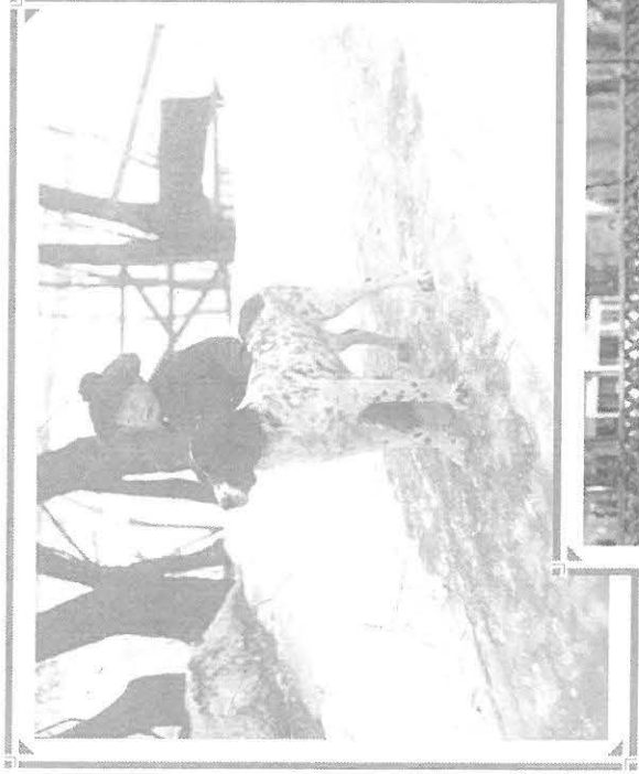
A boy and his dog at the icy Housatonic, c. 1915