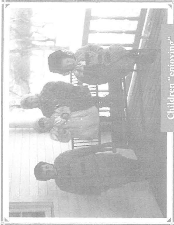
Children "enjoying" winter, Orchard Shade, c. 1915