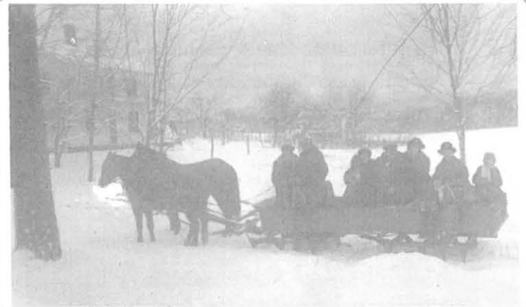
Moonlight bobsled excursion, c. 1920