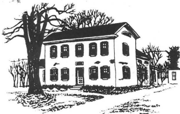
DAN RAYMOND HOUSE