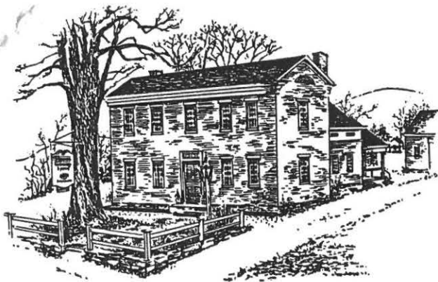
DAN RAYMOND HOUSE