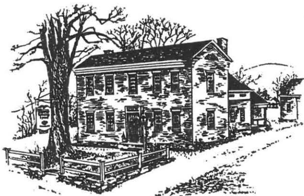
DAN RAYMOND HOUSE

Sheffield Historical Society Sheffield, MA 01257