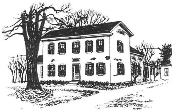
DAN RAYMOND HOUSE