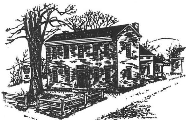
DAN RAYMOND HOUSE